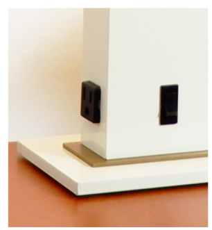
USB & grounded outlet available

See complete options & finishes next page