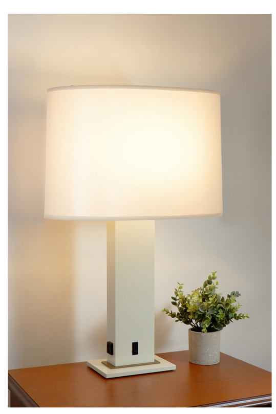
Shown in Cream with Satin Poly Gold accent TriLam shade in Natural available options & finishes page 2