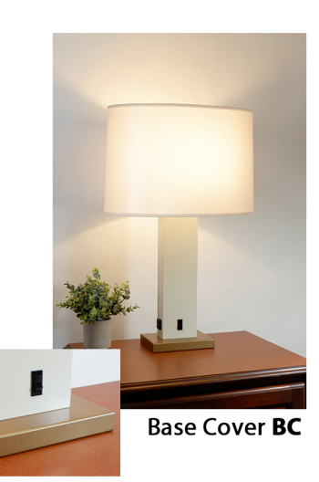
Base Cover option for a different aesthetic

Fixed Space Saver base availeble only with Bolt-Down option