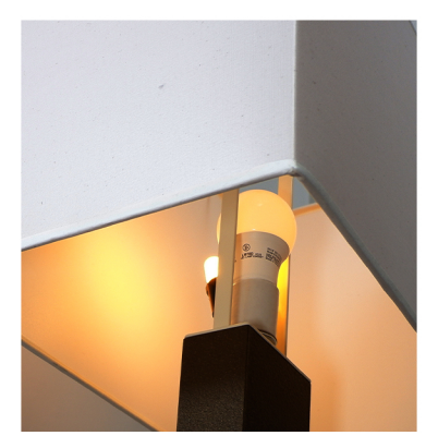
amber LED night light available